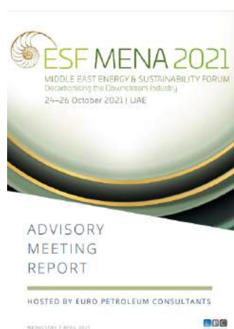
ESF MENA 2021