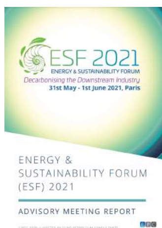
ESF EUROPE 2021