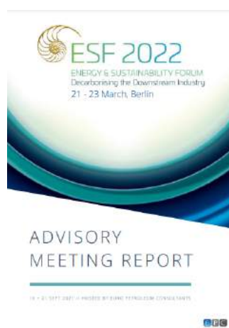
ESF EUROPE 2022